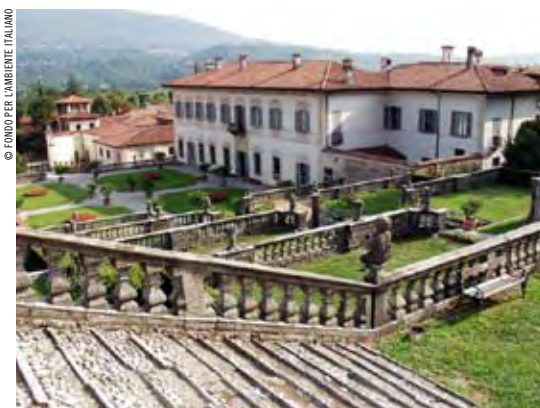
The Villa Della Porta Bozzolo, an FAI property outside of Varese, near Milan, Italy.

Buzzards Bay, Massachusetts, to develop outreach materials and a public awareness campaign on preventing seal entanglements and training materials on the evaluation of injured marine animals; US$40,000 over two years to the Cabrillo Marine Aquarium in San Pedro, California, to continue its Sea Rangers youth conservation program, which trains students as naturalists who conduct tours of the Cabrillo Bay coastal habitat; and US$20,000 to the Pacific Marine Mammal Center in Laguna Beach, California, to help construct four marine mammal rehabilitation pools.