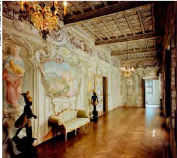
Villa Della Porta Bozzolo, representing five centuries of Italian heritage, is one of the FAI properties that Silversea guests have an option to visit in Italy.

Grupo Xcaret. Grupo Xcaret is a private company that has purchased and leased lands from the Mexican government to develop natural and cultural theme parks along the Caribbean coast of Mexico. All three of the company's parks, Parque Xcaret, which is a private property, and Xel-Há and Garrafón, which are in state natural protected areas and are leased from the government, are accessible to cruise passengers as full-day excursions from Playa del Carmen, Cancun or Cozumel. About 70,000 cruise passengers visited Grupo Xcaret's parks in 2004.