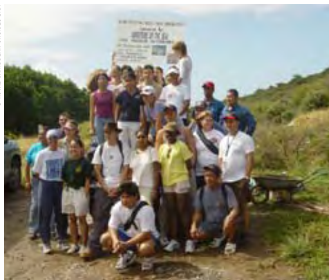
Crewmembers from Adventure of the Seas assist in a clean-up of St. Maarten's Little Bay, in the area around the Bird Blinds and Interpretive Trail.